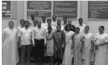
SCC Animators training on 9th March 2014 at Shomoga.