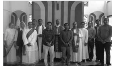
Archdiocesan Deacons training from 23rd to 25th January 2014 at Bangalore. Archdiocese