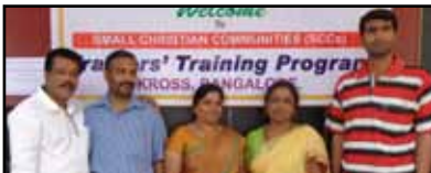
DAT of Mysore Diocese