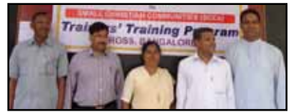
DAT of Shimoga Diocese