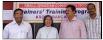
DAT of Shimoga Diocese