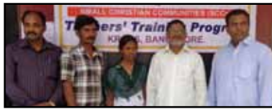
DAT of Belgaum Diocese