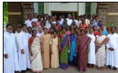
Bellary Diocesan SCC animators training on 6th Oct 2013.