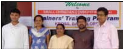
DAT of Mangalore Diocese