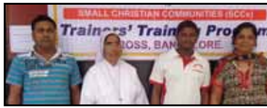
DAT of Belgaum Diocese