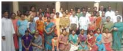
Shimoga Deanery SCC Animators' Training

The history of SCCs in the Diocese of Shimoga dates back to the year 1999 when SCCs were started in the parishes of Kable and Sharavathinagar. The name given to the SCC commission is 'Sahodaya'- 'the Rise of Brotherhood' . The vision of diocesan SCC is: "A communion of Communities where neighbors live in fullness centered on the Word of God and the Eucharist." In order to realize this, the Commission chalks out programs at the ward, Parish, Deanery and Diocesan levels.