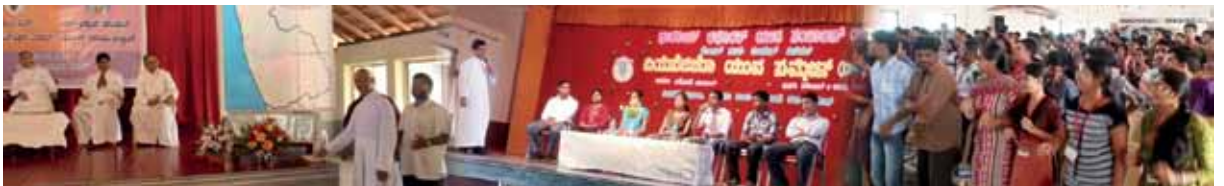
SCC Silver Jubilee Inauguration

The Silver Jubilee of SCCs was inaugurated on May 15, 2012 at the Bishop’s house in the auspicious presence of our Bishop and more than 200 leaders of the diocese, comprising of the Diocesan Pastoral Parishad, Senate members and some distinguished guests.