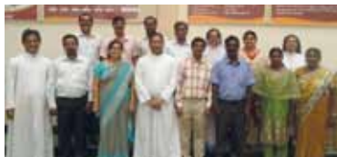
Diocesan Animation Team (DAT) Training