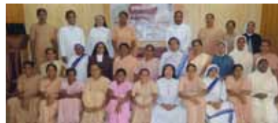
SCC in-charge [Sisters] Training