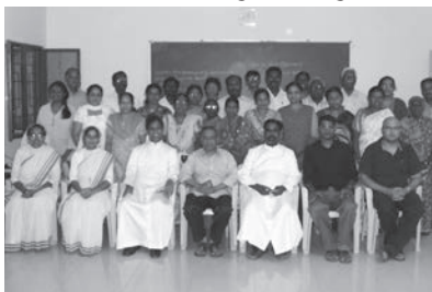
SCC animators training at Sacred Heart Parish