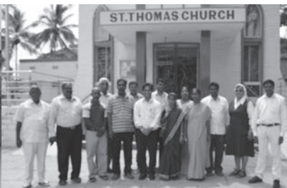
DAT members of Archdiocese