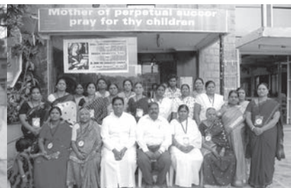
PAT members at St. John the Evangelist